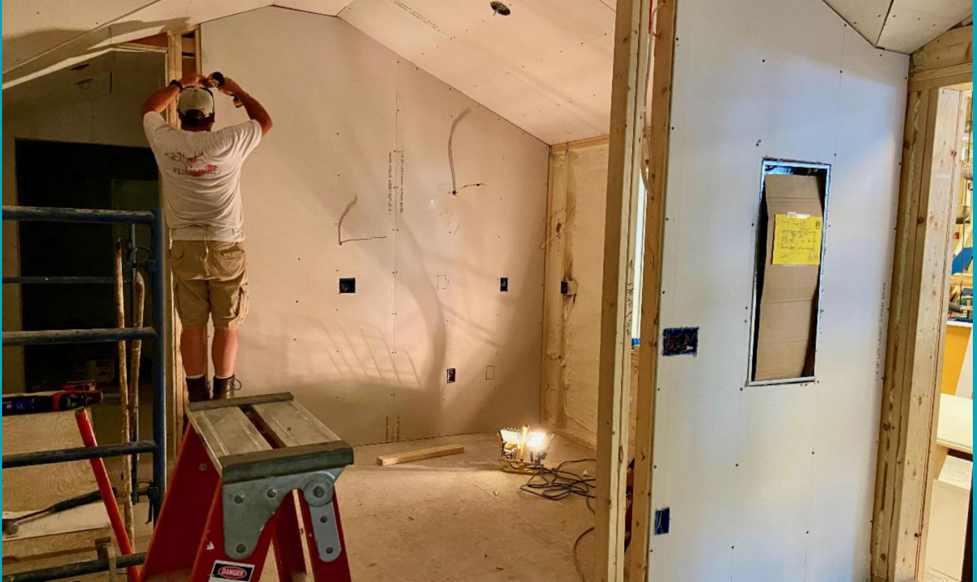
Hanging sheetrock inside the Downeast Maine Tiny House.