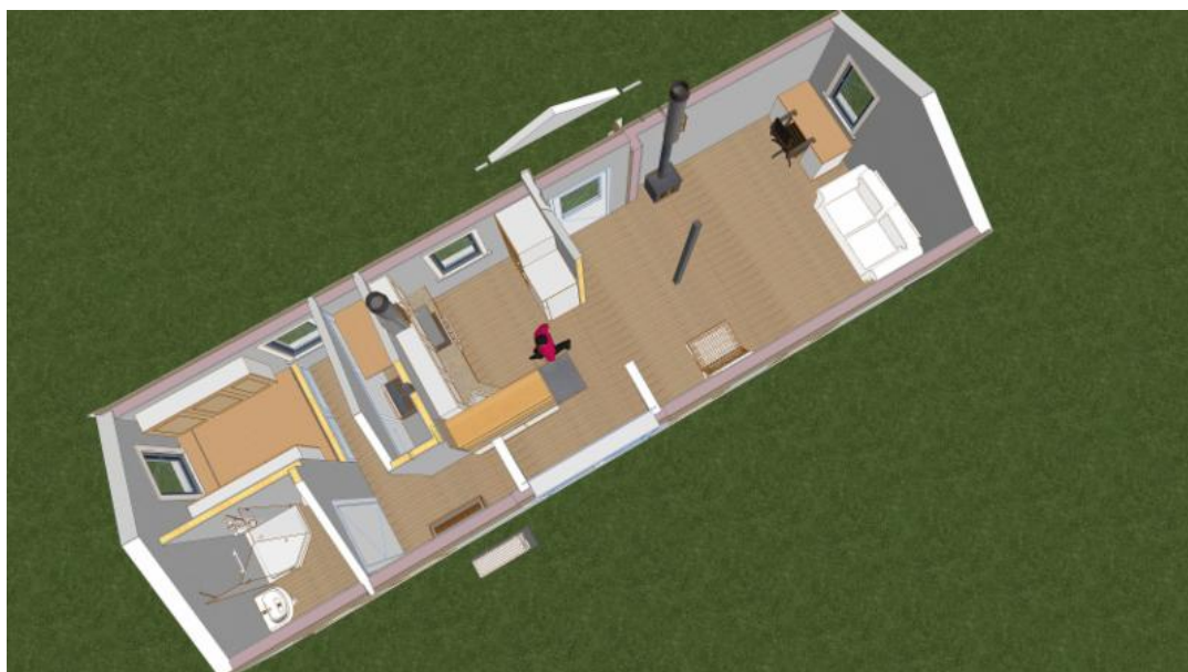
Downeast Maine Tiny House architectural drawing

CHERRYFIELD, ME — Downeast Community Partners, in affiliation with the Maine Seacoast Mission, Assabet Valley Regional Technical High School, and the C.F. Adams Foundation held a press conference on Monday, June 10th at the Weald Bethel Community Center, Weald Bethel Lane, Cherryfield, ME to unveil the Downeast Maine Tiny House Project.