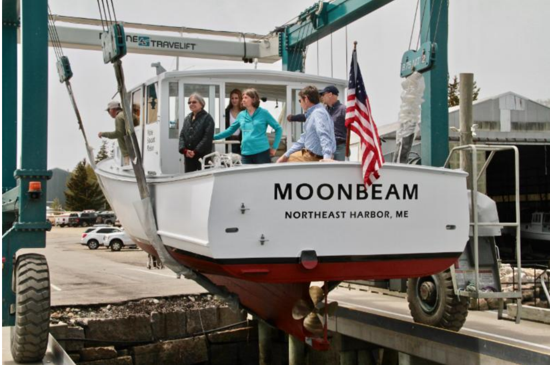
Sunbeam V crew aboard Moonbeam being lowered to the water after christening.