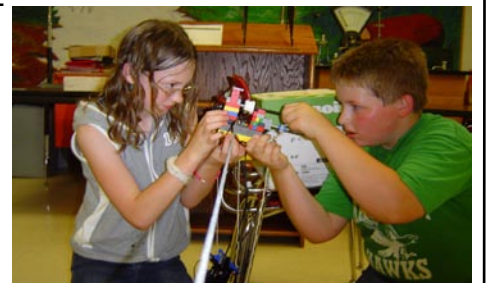
A variety of camp offerings ensures that students can choose activities they enjoy.

Evaluation from the 2004/2005 school year shows that EdGE continues to enhance the lives of youth in Washington County.