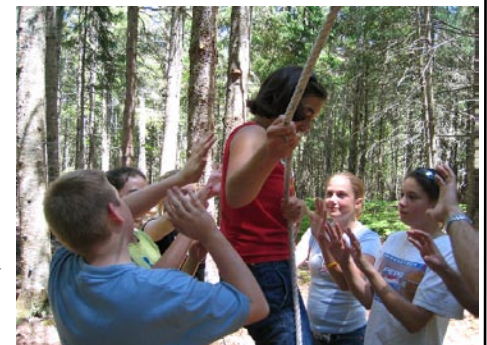
The ropes course in Cherryfield challenges individuals and encourages teamwork.

EdGE offered the following camps in June and July: